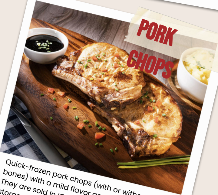
Quick-frozen pork chops (with or without bones) with a mild flavor and fine texture. They are sold in IQF bags for convenient storage and consumption.