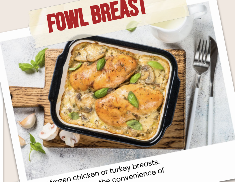
Juicy frozen chicken or turkey breasts. Sold in IQF bags for the convenience of storage and consumption.