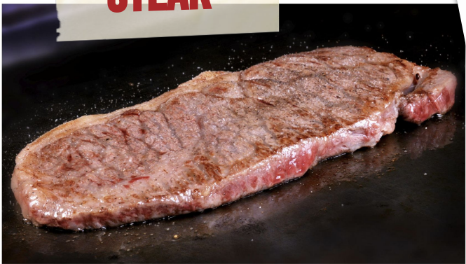
Tender frozen beef steaks. Sold in IQF bags for the convenience of storage and consumption.