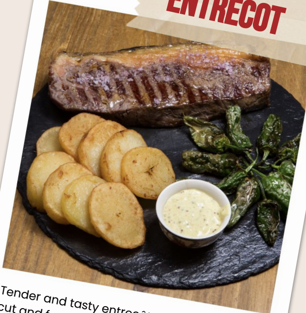
Tender and tasty entrecôtes of about 150g cut and frozen. They are sold in IQF bags for convenient storage and consumption.